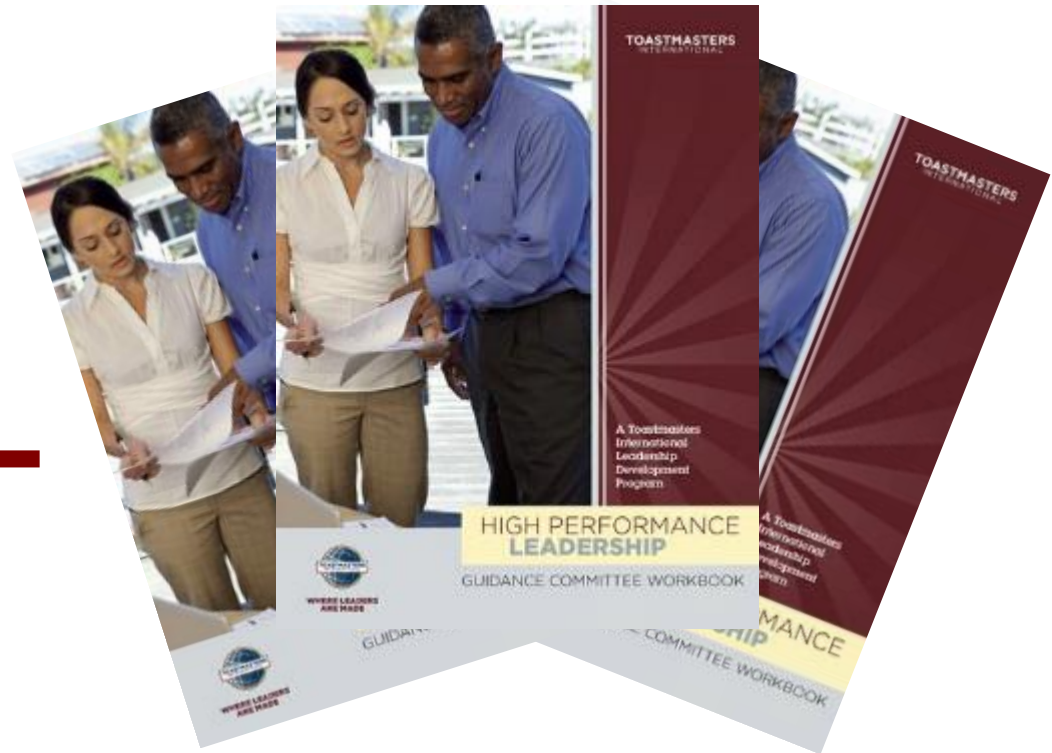
Guidance Committee Workbook